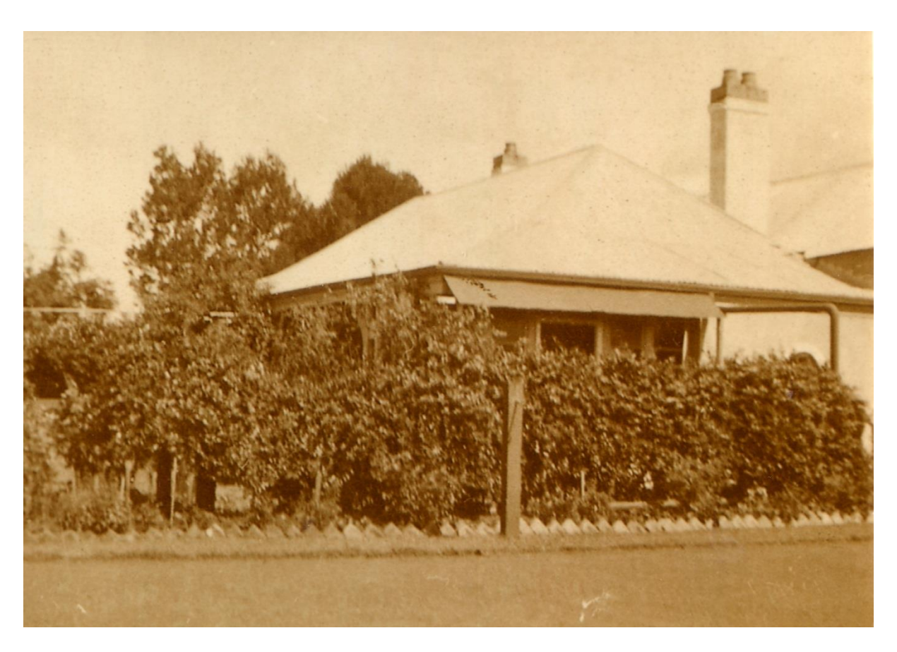
View from the tennis court