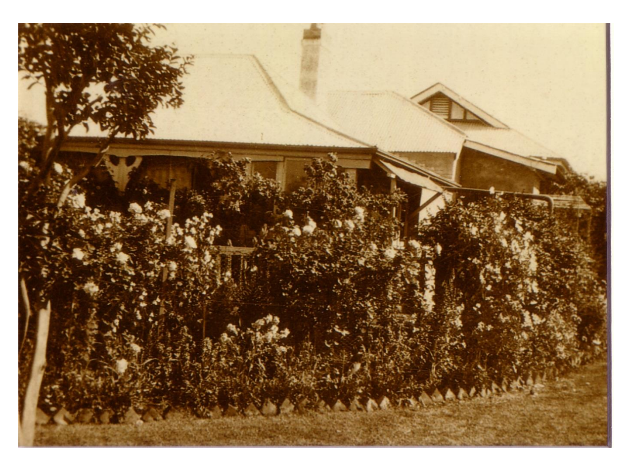
This corner photograph shows the pitched roof of the Billiard Room at the back over the courtyard built by the Shaws and removed by the Bartons Note the top of the original wooden post ('column') on the front veranda