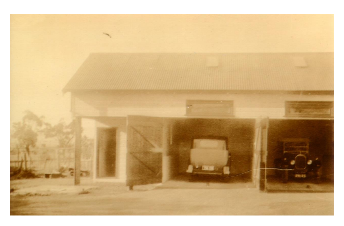
The garages still remain but the cars have changed The 'Man's Room' on the left has been replaced by the Guests Cottage