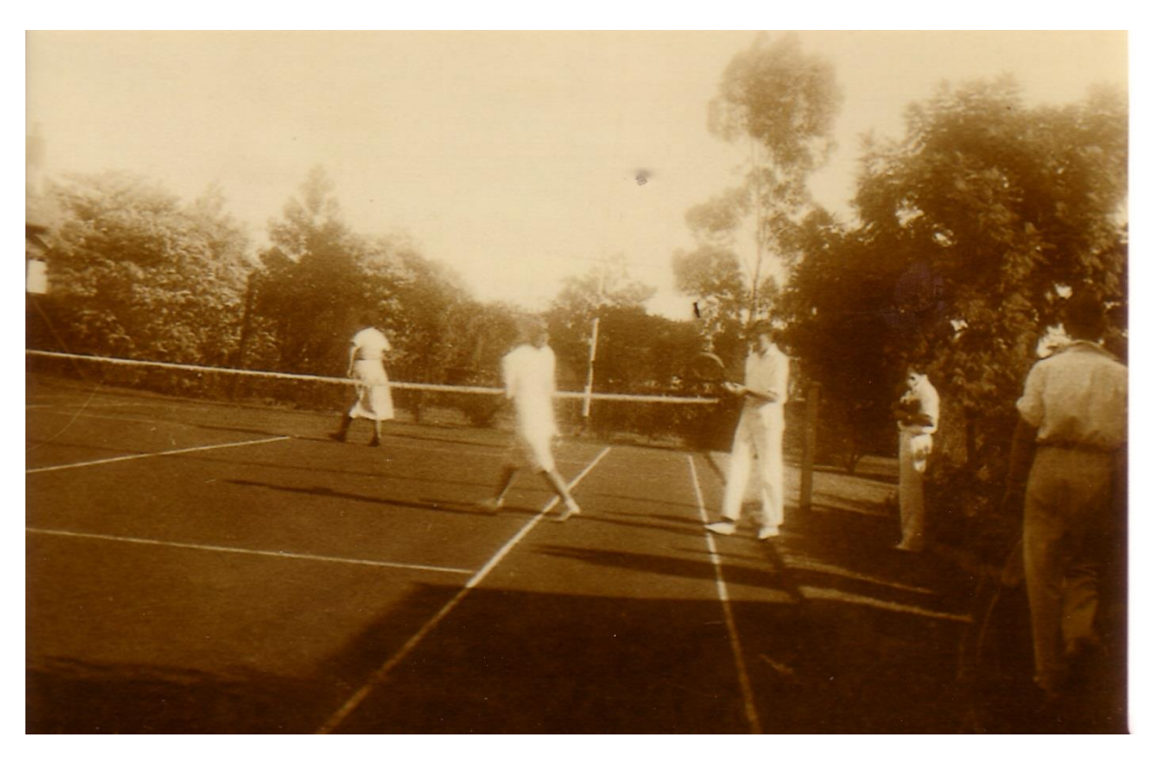
It is rumoured that a major NSW Lawn Tennis Association Country Circuit Tournament was played at 'Geraldton' in the 1930s